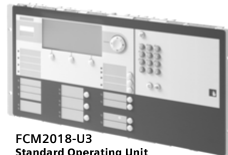
FCM2018-U3 Standard Operating Unit