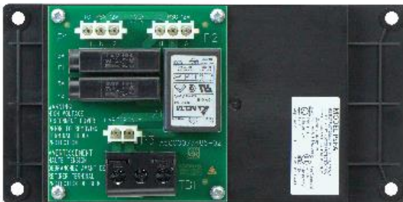
Model PSFA Power Supply Filter Assembly

Model PSFA contains screw terminals for the usage of AC-input power. Model PSFA contains an AC-line filter and two (2) AC-line power fuses rated at 5A. From another connector on Model PSFA, AC power is connected directly to Model PSC-12M, via a keyed-cable harness. Each Model PSFA supports building AC-power-connection circuits for two (2) power supplies – either one (1) for Model PSC-12M and one (1), optionally, for the Power Supply extender (Model PSX-12M.) When more than one (1) Model PSX-12M Power Supply extender is used, a second Model PSFA is required, and must be ordered separately.